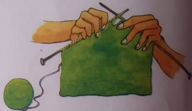
Fig 3.14 Knitting

Have you noticed how sweaters are knitted? In knitting , a single yarn is