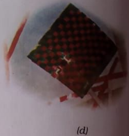
Fig. 3.12 Weaving with paper strips

Fig 3.12 (a) and on the other as shown in Fig.3.12 (b). Cut both the sheets along the dotted lines and then unfold. Weave the strips one by one through the cuts in the sheet of paper as shown in Fig.3.12 (c). Fig. 3.12 (d) shows the pattern after weaving all the strips.