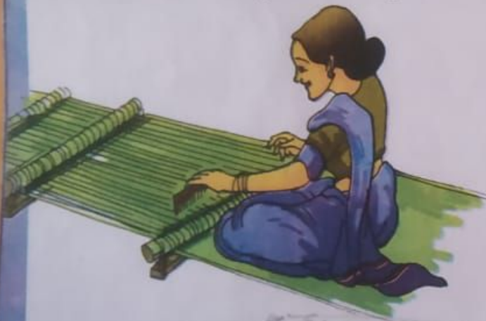
Fig. 3.13 Handloom

Fig 3.12 (a) and on the other as shown in Fig.3.12 (b). Cut both the sheets along the dotted lines and then unfold. Weave the strips one by one through the cuts in the sheet of paper as shown in Fig.3.12 (c). Fig. 3.12 (d) shows the pattern after weaving all the strips.